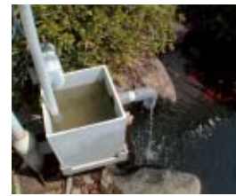
Wastewater storage tank before final discharge

Thanks to these efforts, no lawsuits arose during FY 2003 in connection with accidents, violations, penalties or complaints, and no economic sanctions or incentives were used by the government.