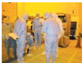
A site inspection underway

By having the facilities in TEL conduct peer assessments, we are striving to determine the status of TEL facilities overall, and this will lead to uniformity and improvement of EHS activities. During FY 2003, we conducted assessments on management-level initiatives, legal compliance, and responsibilities/structures, based on TEL regulations for work safety. In FY 2004, we will select new themes and details and work to make further improvements.